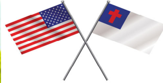
Our "Pride" Flags!